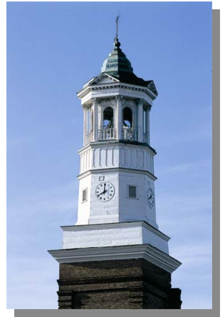
Camden Clock Tower