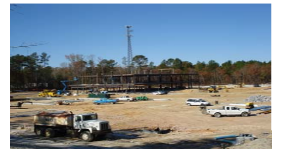
Construction on the new KCMC medical facility is underway

The County also celebrated the grand opening of the office park by thanking its many partners on the project including Fairfield Electric Cooperative as a contributor to the land purchase and AT&T for providing and infrastructure grant. Kershaw County purchased the 60-acre property in 2005 and started immediately talking with KCMC about being a tenant in the park. In 2007, Kershaw County Medical Center purchased nine acres in Wateree leading the way for the new facility.