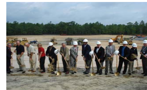
KCMC and Kershaw County officials break ground on the new Elgin medical center

On August 27th, officials from Kershaw County Medical Center and Kershaw County came together to celebrate the groundbreaking of the hospital's Elgin facility as well as the grand opening of Wateree Executive Park. KCMC's 42,000 square foot facility is scheduled to be complete in 2009. When finished, the two story complex will house urgent care services and imaging services including MRI, X-Ray, and digital mammography. Cardiology services will also be offered.