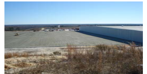
Construction on Target Corporation expansion began in October

The company plans to invest $73 million in the building and additional machinery. This expansion is a direct result of the growth of Target stores in the southeast. Currently, the Lugoff facility services 60-74 stores in South Carolina, North Carolina, Florida, Georgia, and parts of Tennessee. When completed, the number stores serviced will reach 100.